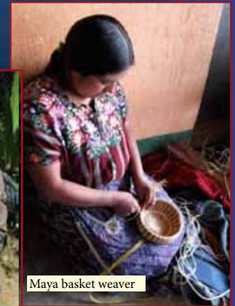
Maya basket weaver

Farmer to Farmer Trips to Guatemala and Honduras January 2012